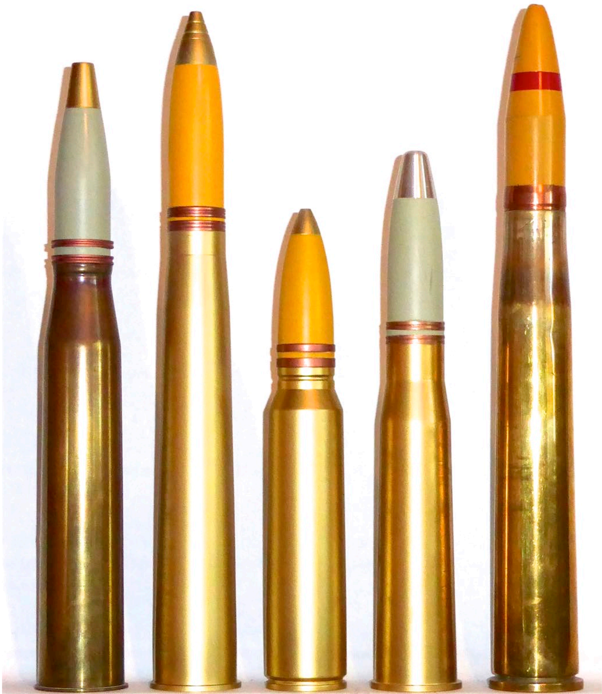
The ammunition (from left to right: 37 x 277R service round used in M1925 and M1932 (replica projectile); 37 x 296R Schneider M1930 (replica); 37 x 208 Hotchkiss (replica); 37 x 218R A.N. M1935 (replica); 40 x 311R Bofors.